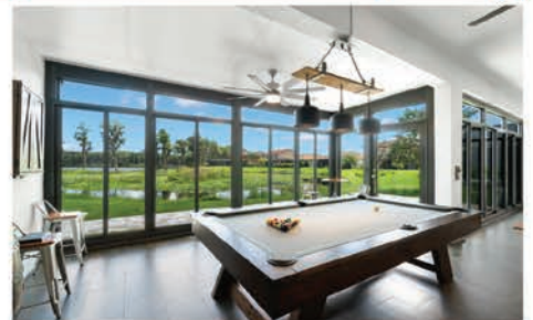
**All photos in this ad are actual Lifestyle Remodeling Customers**